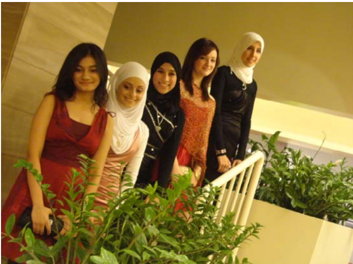
The Grade 9 girls gather on the stairs for a photo.