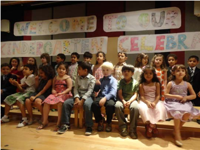
Senior Kindergarten students waiting to receive their Kindergarten Diplomas.