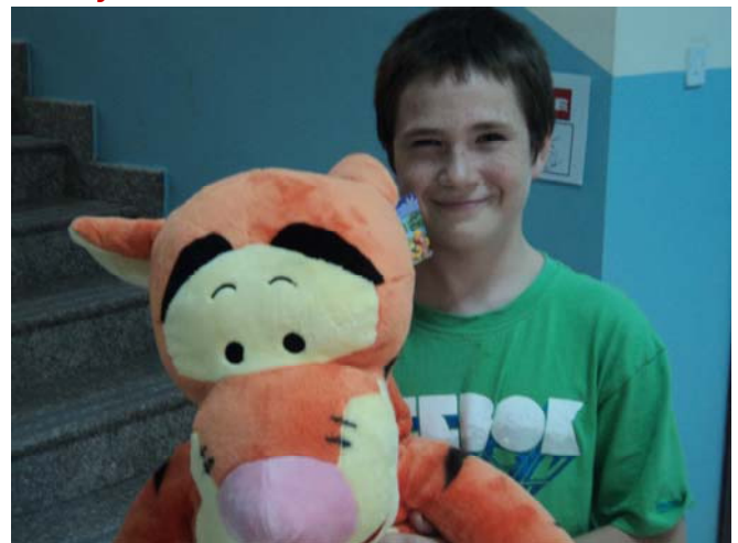
Cooper and Tigger are all smiles as this Grade 5A student was one of the lucky draw winners.